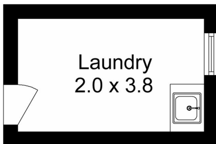
External Laundry (Not In Position)